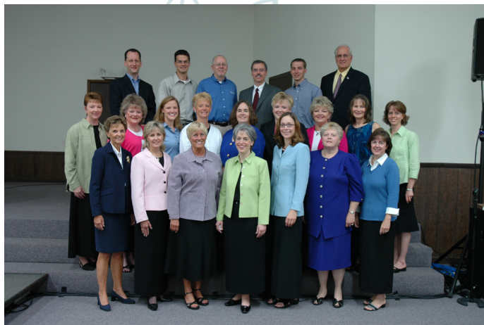
ROH Staff 2005

God's faithfulness, the generosity of friends like you, and this ministry's decision to say "Yes, Lord," has led to women experiencing restored relationships, wholehearted surrender, and the hope of Christ. Women still need to hear the truth, which is why we continue to pursue the mission of helping them thrive in Jesus. We look ahead with gratitude and expectancy because the cry of our heart is still the same as it was twenty years ago: Yes, Lord.