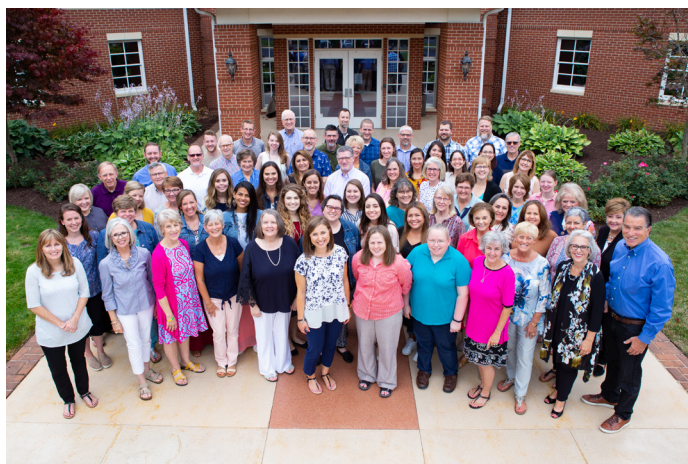
ROH Staff 2019